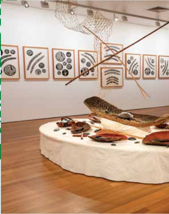
Explore our unique heritage, cultural-side and creative community.