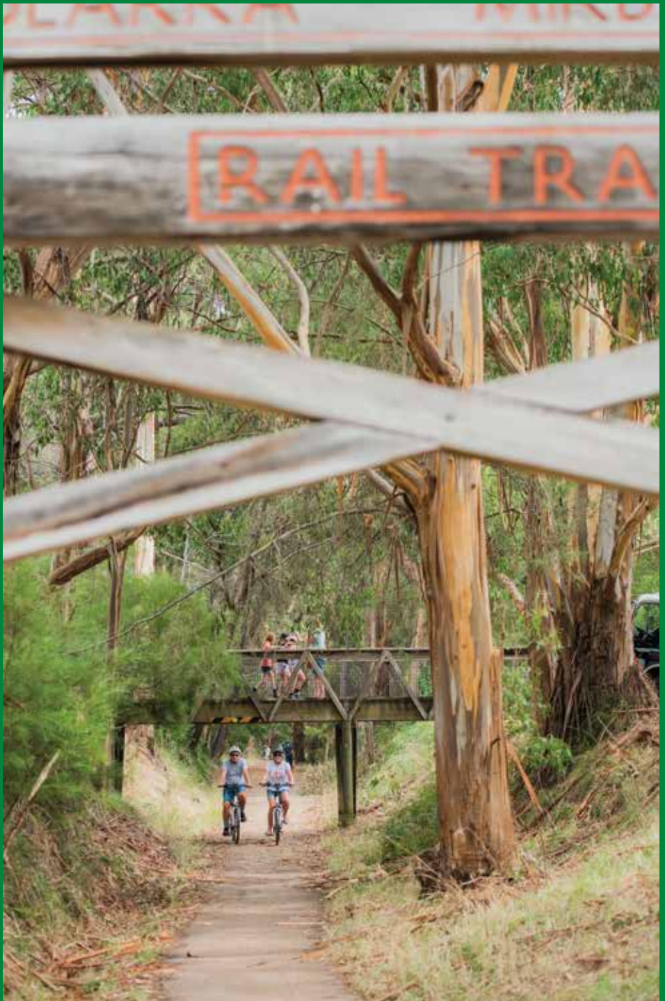
Dive into adventure with mountain biking, rail trails and so much more.