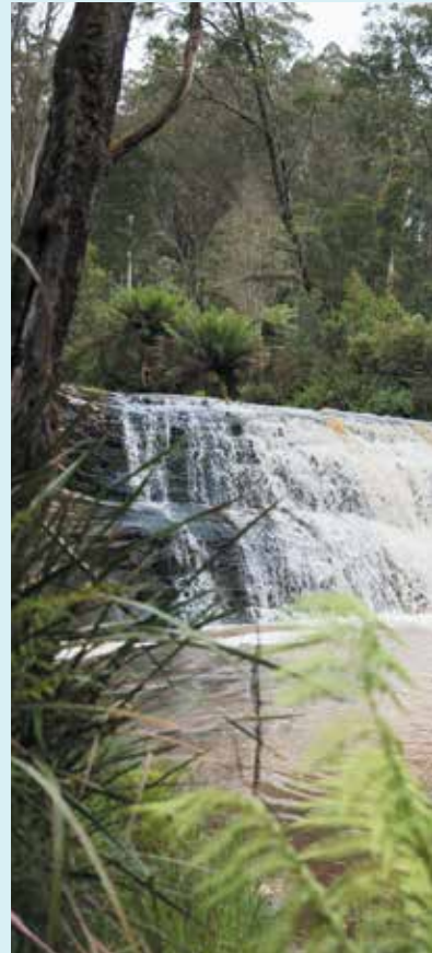
Immerse yourself in our beautiful natural surroundings and national parks.